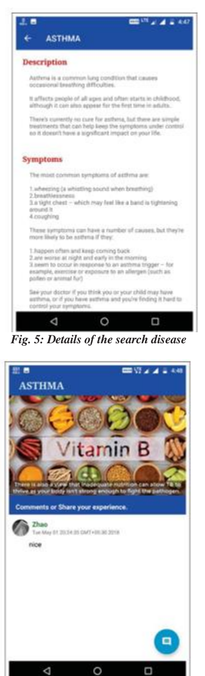
Fig. 6: Videos of Search Disease

Fig. 6 shows the videos where the user can watch homemade remedies for the immediate relief and also share the feedback and experience about the query.