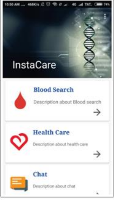
Fig. 3: Home Screen

Fig. 5 describes the detailed description about the particular diseases, where he can find basic knowledge and remedies about the requested diseases.