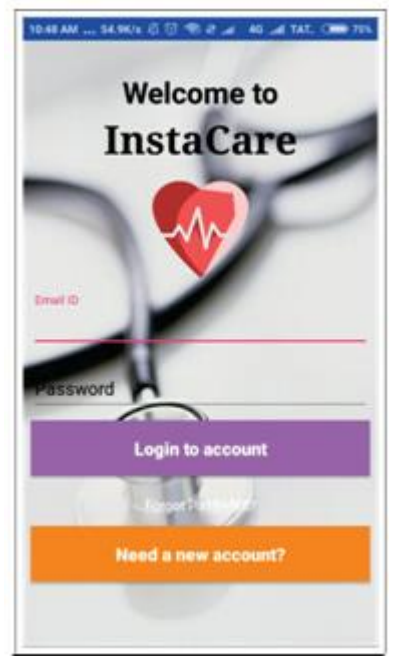
Fig. 2: Login Page

The proposed System Scenario involves the following steps: